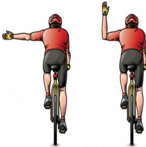
LEFT TURN RIGHT TURN

Construction Projects: Please be reminded to get your permits before your building or landscaping project. Permit fees double when taken out after the fact. It's always better to call first and ask questions before you start your project. You could save big money by getting in contact with our Building Inspector, Bob Gerbers. You can reach him by email at bgerbers@townofrockland.org , or by cell phone at 655-8602.